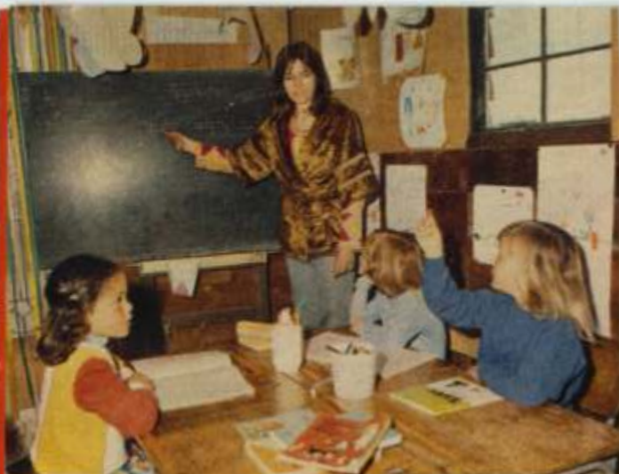
★ SCHOOL'S in at the Brotherhood's community classroom with the best teacher-pupil ratio in Australia.