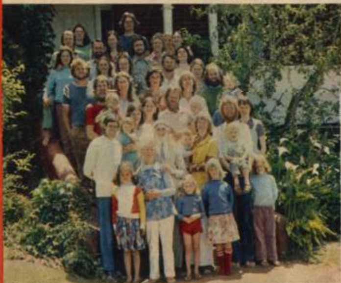
★ MEMBERS of the Universal Brotherhood at Balingup (WA) live harmoniously and prepare for the Millennium.