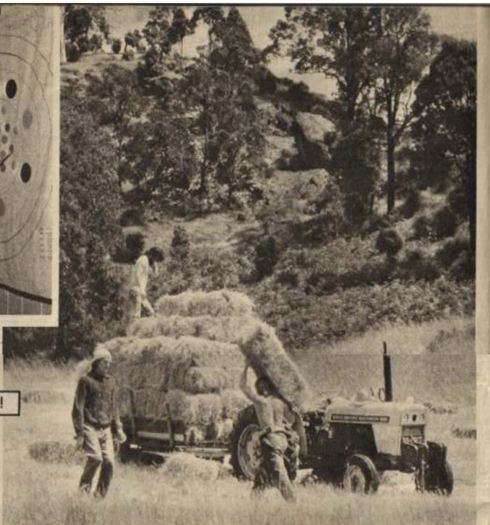
★ THE Brotherhood is a monastery — but they work to support themselves on the farm.

In the evenings they make their own fun, with square dances such as the "Brotherhood reel" and self-penned songs like "I am a child of Mother Earth—she makes my heart rejoice."